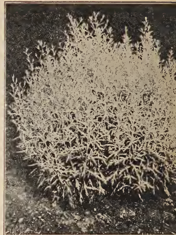
Artemisia, Silver King